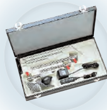
35303 Fiber Optic Sigmoidoscope Set