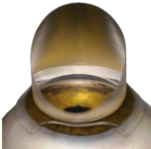
Photo represents image of a model eye.