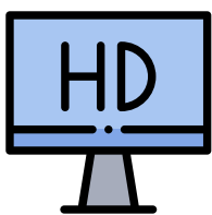
High definition imaging