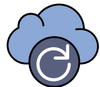
Cloud service system