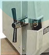
Double safety locking device prevents door from opening while chamber is pressurized.

Simply put - another innovative idea from Tuttnauer.™