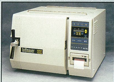
Shown: Model 2340EKP with optional printer

The Tuttnauer Kwiklave is available in various chamber sizes and with an optional printer. Call your Tuttnauer dealer for complete information.