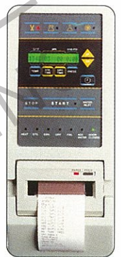
Available as Models 2340EKP and Model 2540EKP.