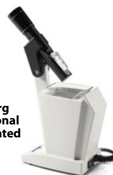
Goldberg w/Optional Illuminated Stand