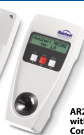
AR200/TS METER-D with Optional Communications Cradle