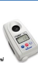
r 2 mini