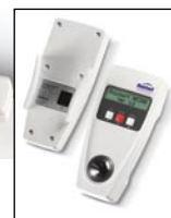
AR200 Refractometer with optional IR Communication Package allows for Reading Log, Calibration Log, and Custom Scale transfer to any PC.