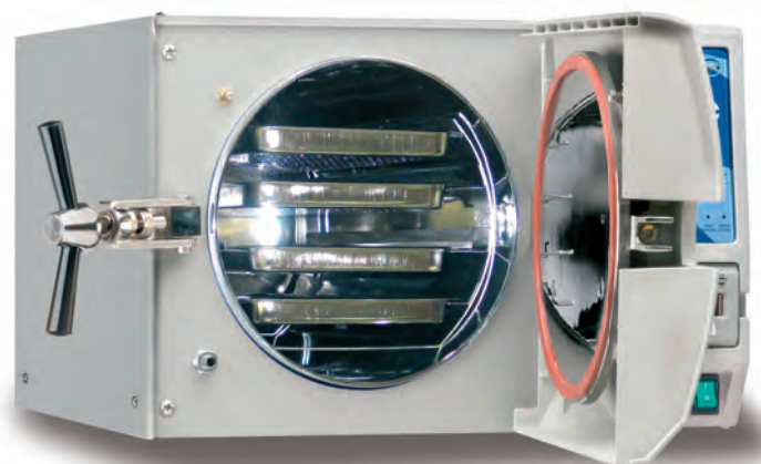
EZ10 with 4 large trays

* Above photo shown with optional printer