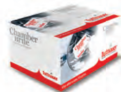
Chamber Brite Autoclave Cleaner