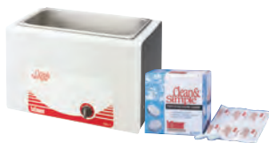
Clean&Simple™ Ultrasonic Cleaners and Tablets

Documents: date, time, temperature, pressure.