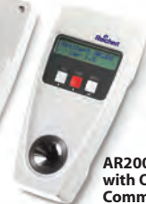
AR200/TS METER-D with Optional Communications Cradle