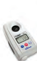
r 2 mini