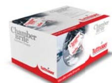
Chamber Brite Autoclave Cleaner