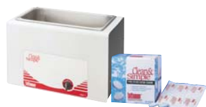
Clean & Simple™ Ultrasonic Cleaners and Tablets

Documents: date, time, temperature, pressure.