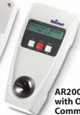
AR200/TS METER-D with Optional Communications Cradle