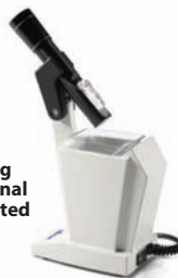
Goldberg w/Optional Illuminated Stand