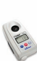
r 2 mini