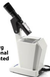
Goldberg w/Optional Illuminated Stand