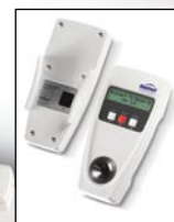
TS Meter-D Refractometer with optional IR Communication Package allows for Reading Log, Calibration Log, and Custom Scale transfer to any PC.