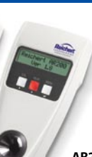
AR200/TS METER-D with Optional Communications Cradle