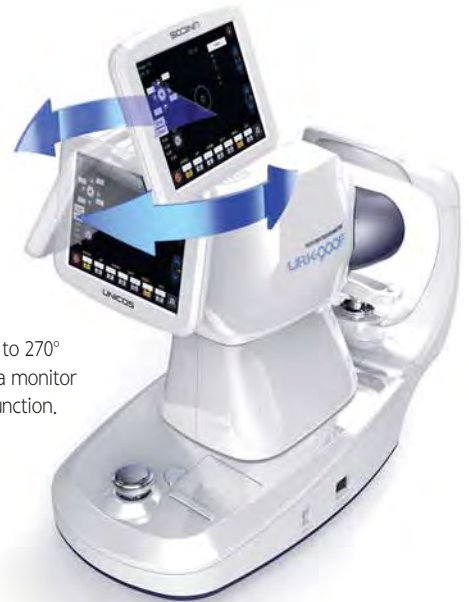
LCD Swiveling to 270° provides a monitor reverse function.

High speed Printer prints out the final measurement results in 3 seconds. Also, it cuts paper automatically after printing.