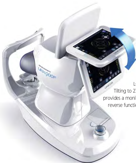
LCD Tilting to 270° provides a monitor reverse function.