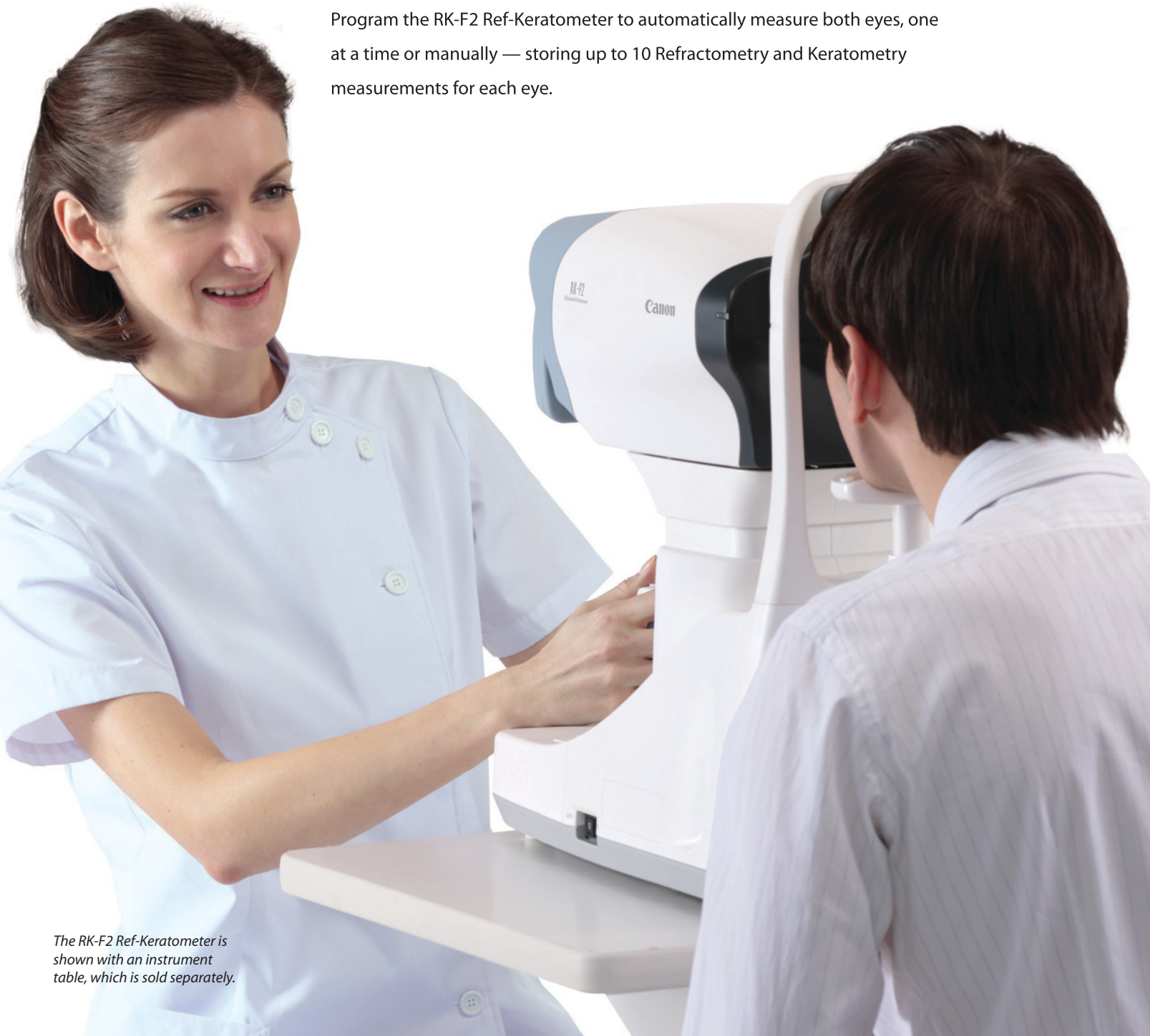
The RK-F2 Ref-Keratometer is shown with an instrument table, which is sold separately.

Program the RK-F2 Ref-Keratometer to automatically measure both eyes, one at a time or manually — storing up to 10 Refractometry and Keratometry measurements for each eye.