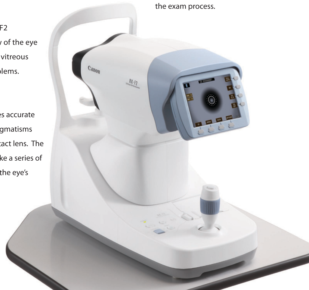
Table sold separately.

The RK-F2 Ref-Keratometer is compact and designed to be operated either sitting or standing, whichever is more comfortable for the operator. Weighing a little more than 33 pounds, the lightweight RK-F2 Ref-Keratometer maximizes small work areas and comfortably fits on a Canon instrument table (sold separately) with a Canon Full Auto Tonometer or Canon Non-Mydriatic Retinal Camera (both sold separately). Keeping the Canon machines next to one another can help expedite the exam process.