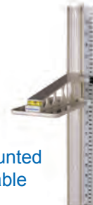
PORTROD Optional Wall Mounted Height Rod Available