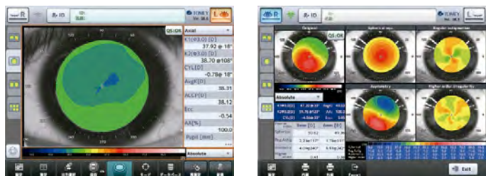
Single map: post LASIK eye

Topo function to detect irregular corneal shape