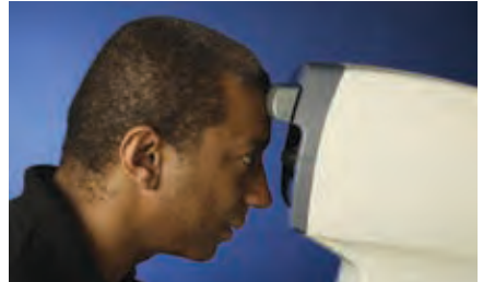
Improper patient alignment (chin moved away from unit)