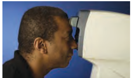
Proper patient alignment (chin close to unit)