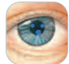
Small pupil mode