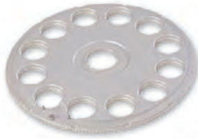
Precision machined, industrial strength aluminum lens dials