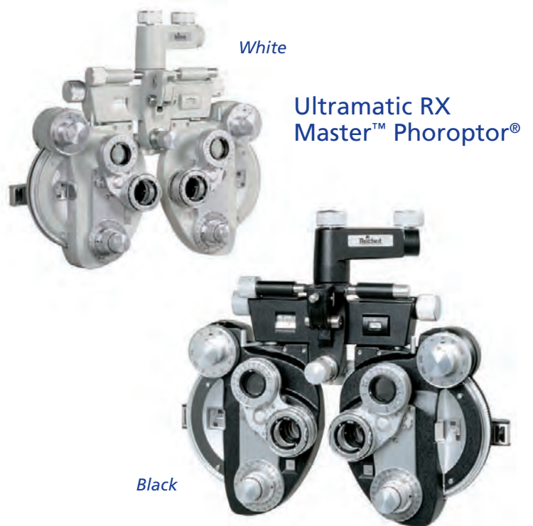
Ultramatic RX Master™ Phoroptor ®

Every Phoroptor ® has that unmistakable feel of quality. The smooth rotation of the dials. The virtual absence of play in the mechanisms. The precise, solid click of the control knobs. Constant reminders that you're using the world's finest refracting instrument. It's a fit and feel no one can duplicate, any more than they can duplicate the Phoroptor ® 's optical quality, accuracy and reliability.