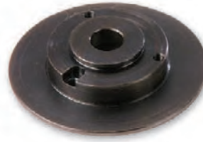
Heavy duty, precision bearing races