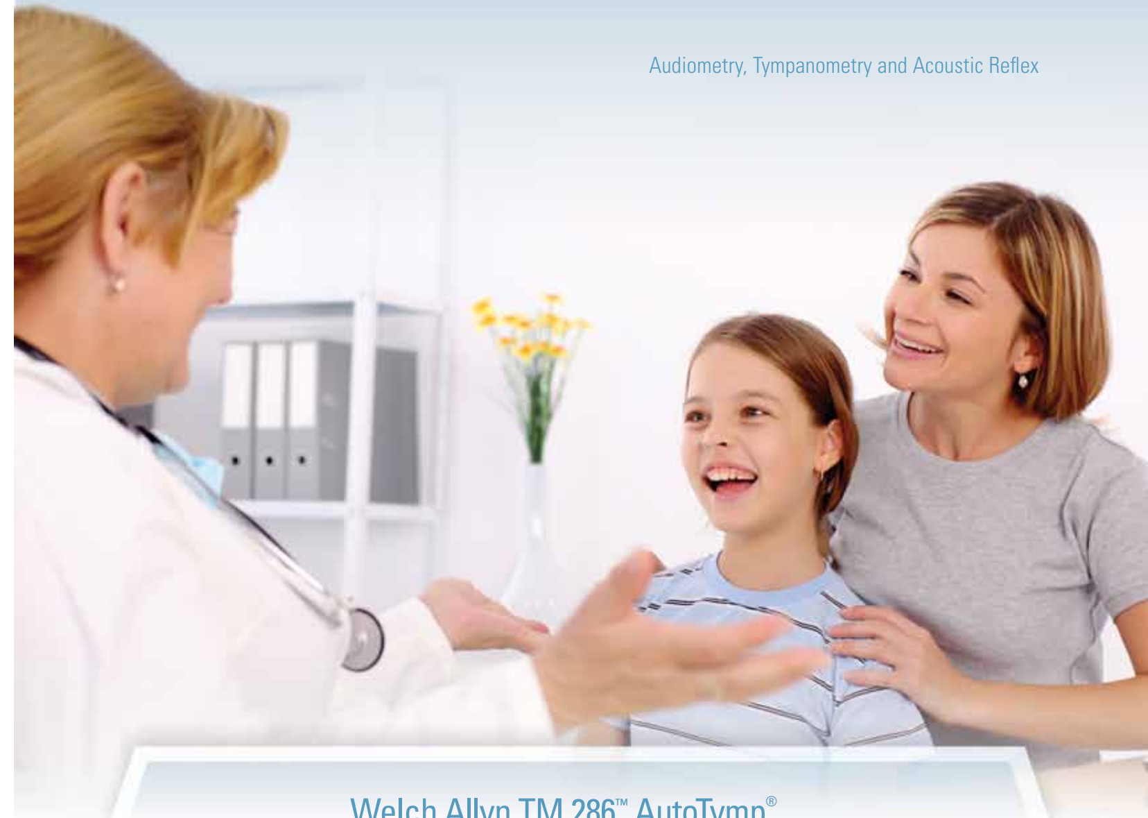
Audiometry, Tympanometry and Acoustic Reflex