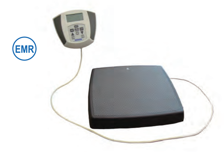
Remote Display can be mounted on a wall or placed on a table