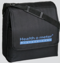
Carrying Case for 349KLX Item# 64771