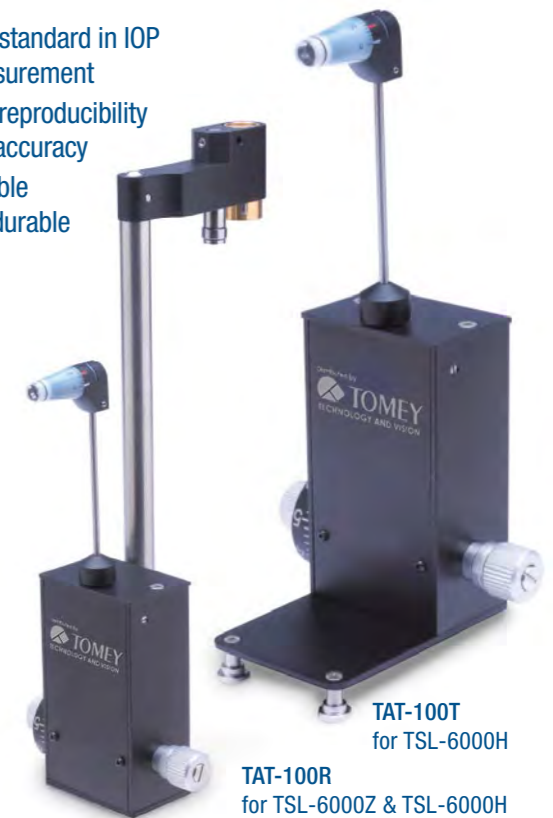
TAT-100T for TSL-6000H TAT-100R for TSL-6000Z & TSL-6000H