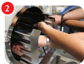
2 Remove the tray holder/rack