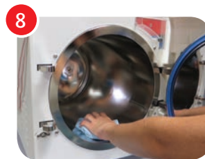
8 Wipe the interior of the chamber with a damp cloth or sponge. Clean the water sensor in the rear of the chamber with a damp cloth or sponge. Cleaning the dirt off the sides of the sensor is more important than the tip. (see sec. 12.6). The unit is now ready to sterilize.