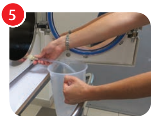
5 At the end of the cycle, open the door and drain the entire contents of the water reservoir.