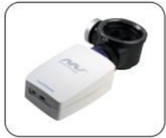
Firefly Digital Camera + Beam splitter

It's easy to upgrade your S360/S360S to a Digital Slit Lamp with Firefly Digital Module Kit (Firefly Digital Camera, Beam Splitter, MediView Software, USB Cable, Background Illumination Module).