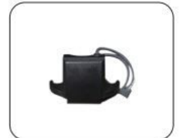
Background Illumination Module