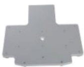
Metal Plate (work with refraction units)