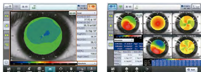
Single map: post LASIK eye

Topo function to detect irregular corneal shape