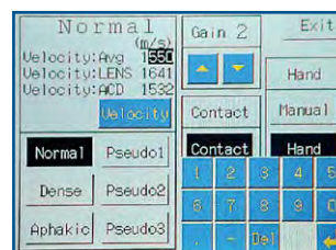
The AL-100 provides full access to ultrasound velocities