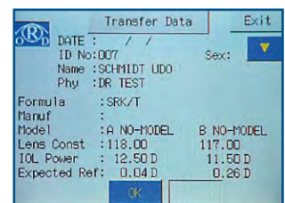
Comfortable data transfer to memory card or RS-232 port

2012/04 - subject to change without notice