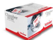
Chamber Brite Autoclave Cleaner