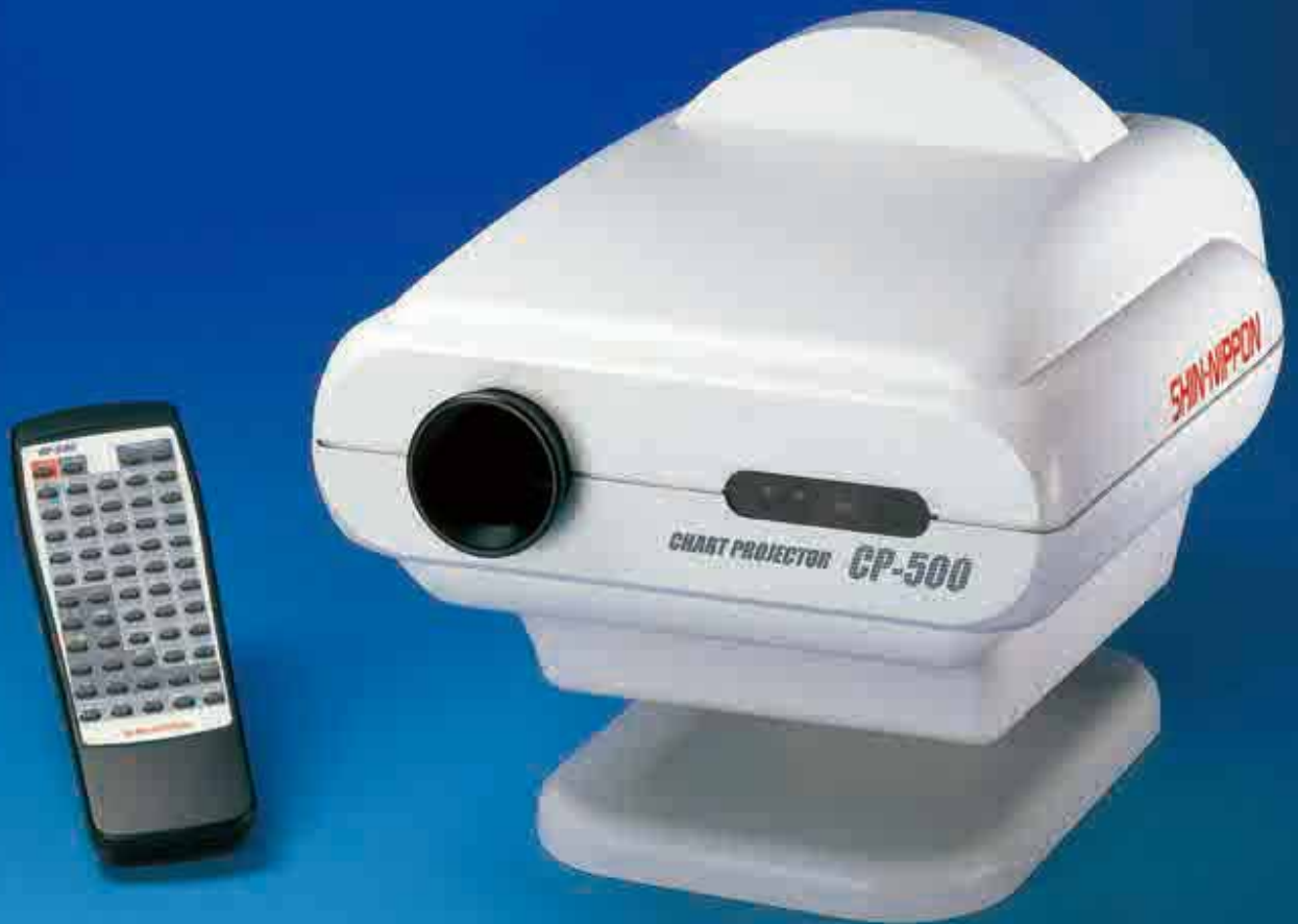
CHART PROJECTOR CP-500