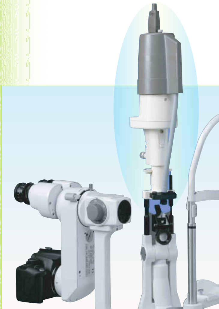
The 1159 in combination with the 1108 SnapShot Digital Camera Adaptor.