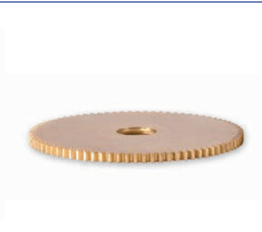
Precision machined, heavy duty solid brass gears