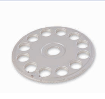
Precision machined, industrial strength aluminum lens dials