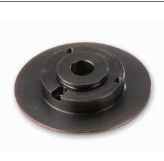
Heavy duty, precision bearing races