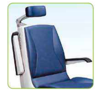
Ergonomically designed arms rotate up for patient flexibility.