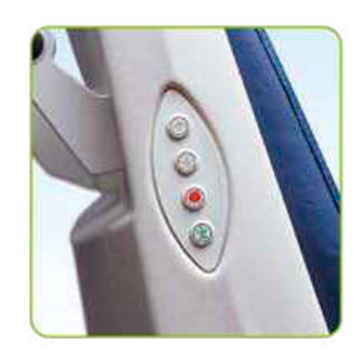
New overlay switch panels on both sides of the chair for convenient fingertip adjustments.

eliminates many complicated and unnecessary components, resulting in much greater reliability.