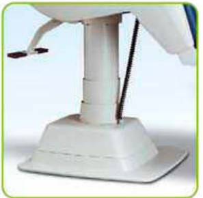
Exclusive hydraulic cylinder system.

reclining any size patient easy and instantaneous; no electronic motors to slow you down! The Marco E-Z Tilt also incorporates the only double hydraulic cylinder system in the industry, creating an extended range of elevation - from extra low to extra high, that accommodates a