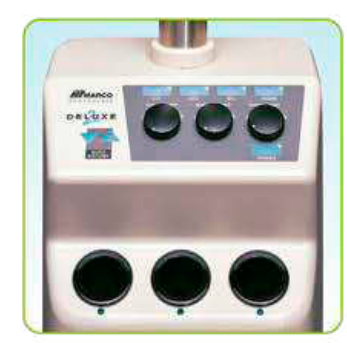
Deluxe 2 Stand fullfeatured instrument control panel, Stock #1206

durability, the new Deluxe 2 Stand also remains competitively priced. For a compelling side-by-side demonstration against any other instrument stand, contact your local authorized Marco distributor.