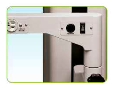
Deluxe 2 Lower Slit Lamp Arm

market. Innovative features such as an electronic slit lamp arm release button, overhead room light switch, and a laborious ten-step hand-finished painting process make the Deluxe 2 Stand a unique and differentiated product. While maintaining our usual high standards of function, quality and