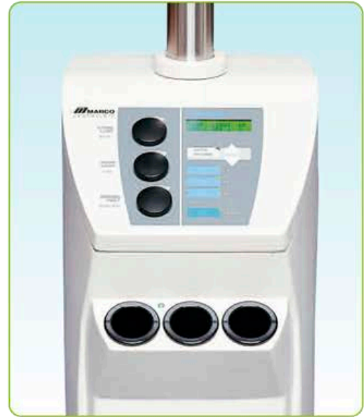
Stock #1290 – Limited programmability controls only the Stand Lamp.

Although we have redefined the electronic technology of the ophthalmic instrument stand, our main focus was to maintain the quality of materials and internal mechanisms that created the reputation of the Deluxe 2 Stand. Marco instrument stands have always been noted for their rugged durability, and the Encore was built around that same philosophy. The look is modern, but the innovation and quality is strictly a Marco tradition.