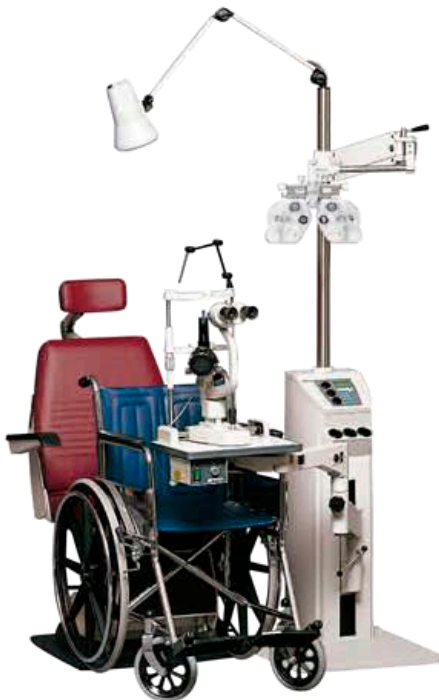
Stock #1291 – Full perc programmability controls Overhead Room Lights and Stand Lamp.

Ask your Marco Distributor about The Marco Package Plus Program.